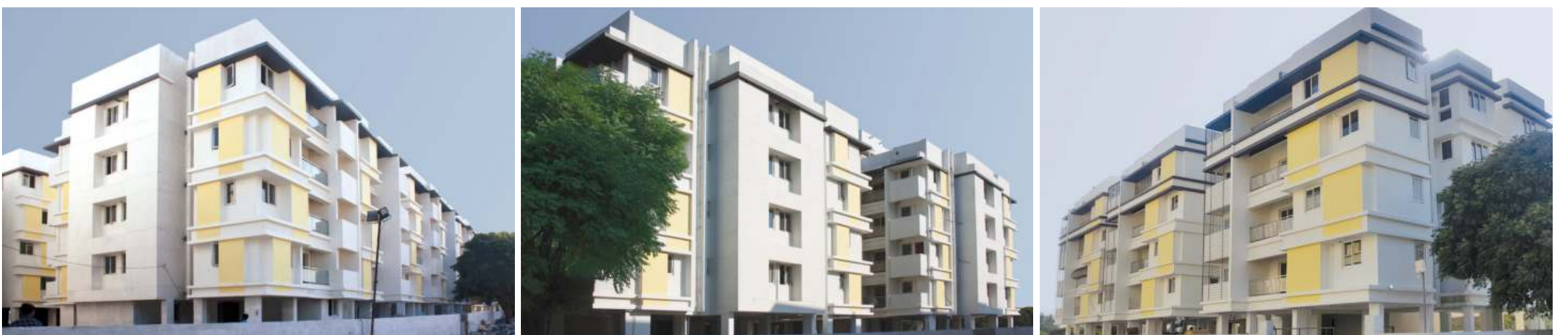
Actual photos taken at site