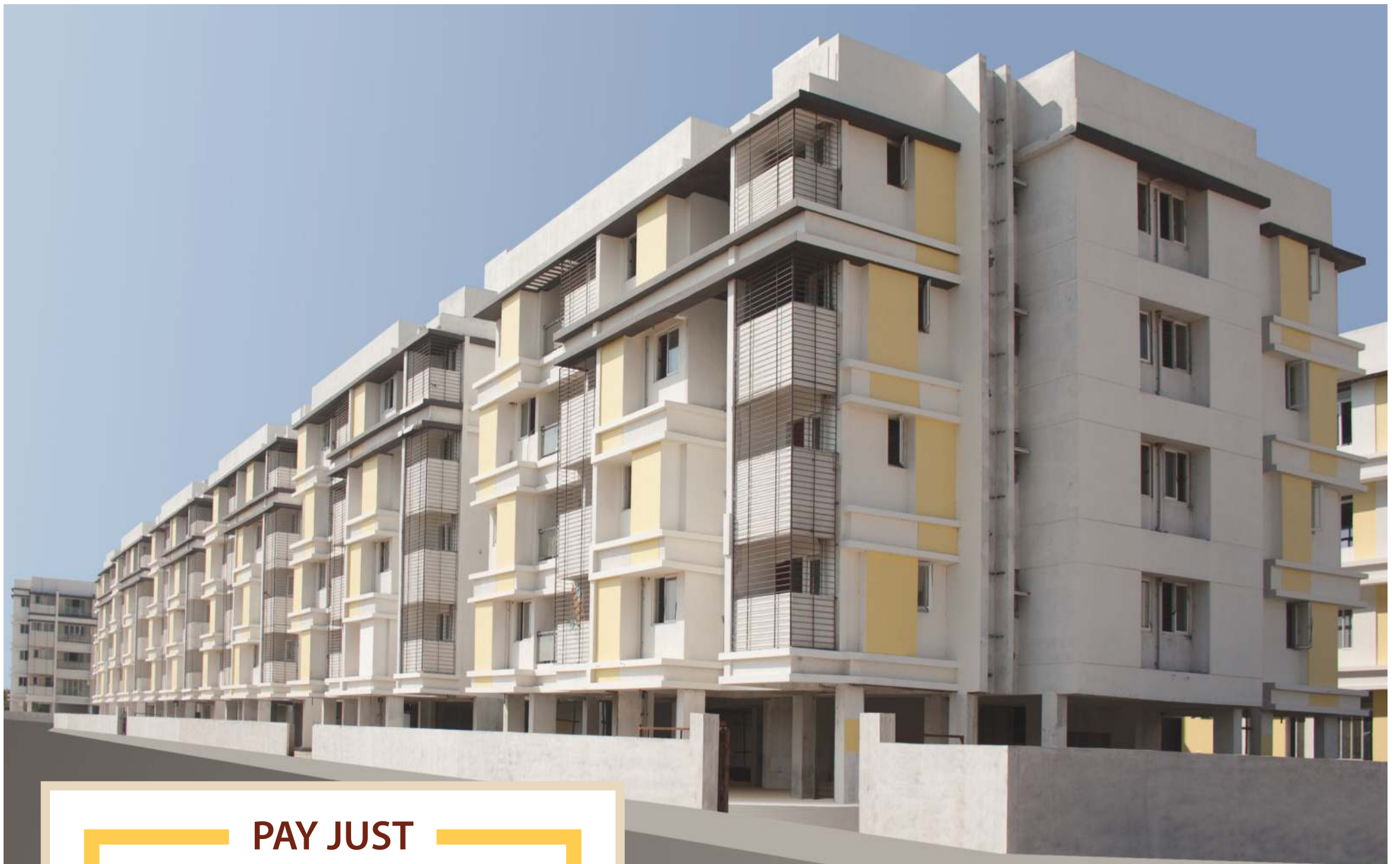
Actual photo taken at site