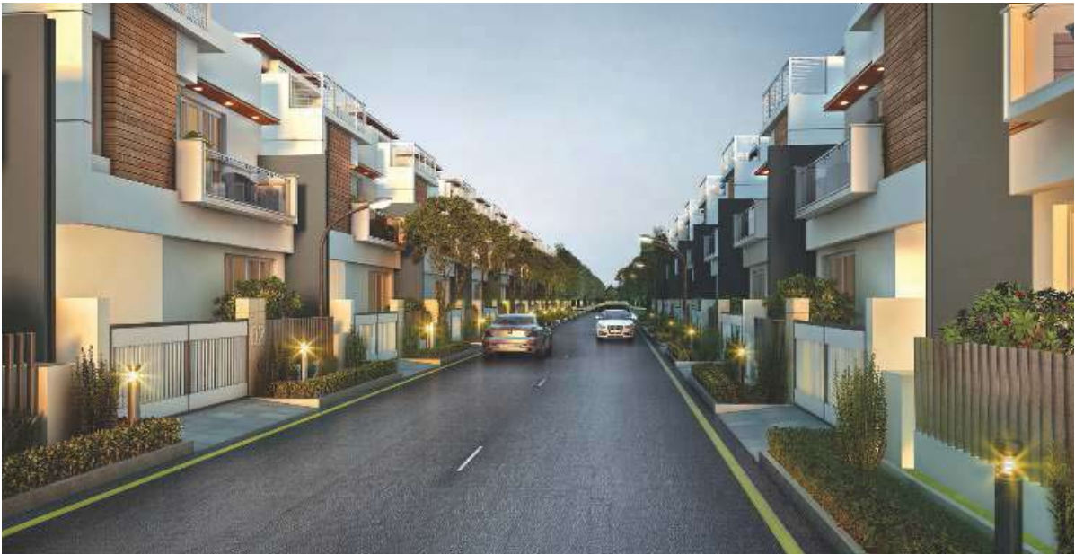
Uniquely Themed Streets

S&P Foundation Private Limited. 4th floor, #7, City Towers, 3rd Cross Street, Kasturba Nagar, Adyar, Chennai, Tamil Nadu - 600020