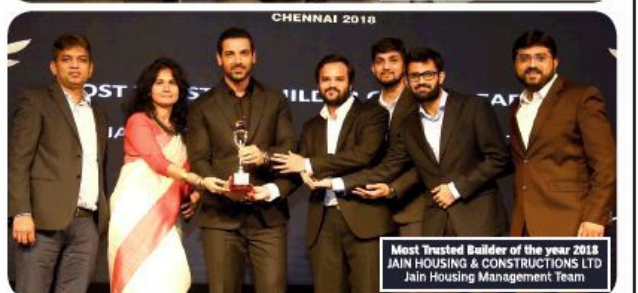
Most Trusted Builder of the year 2018 JAIN HOUSING & CONSTRUCTIONS LTD Jain Housing Management Team