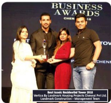
Best Iconic Residential Tower 2018 Vertica by Landmark Housing Projects Chennai Pvt Ltd. Landmark Construction - Management Team