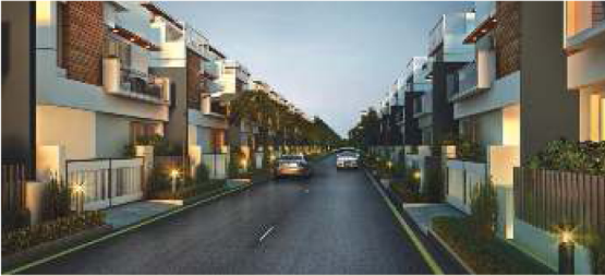
Uniquely Themed Streets