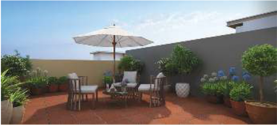
Your Very Own Private Terrace