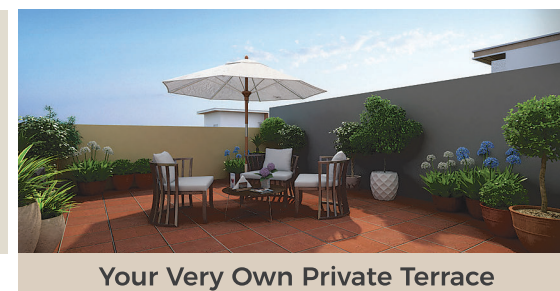
Your Very Own Private Terrace