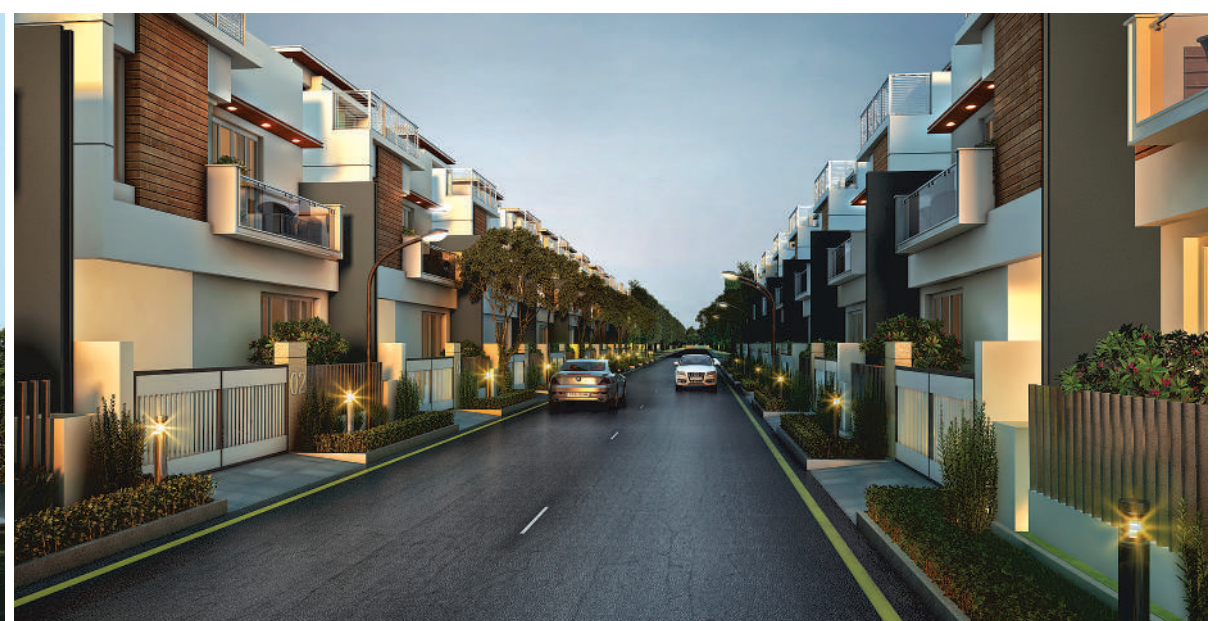
Uniquely Themed Streets